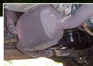
Catalytic converter thefts targeted

Plus the latest news on rural and environmental policing in Kent