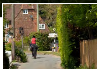
Horse safety on the road