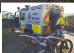
Tackling nuisance riders