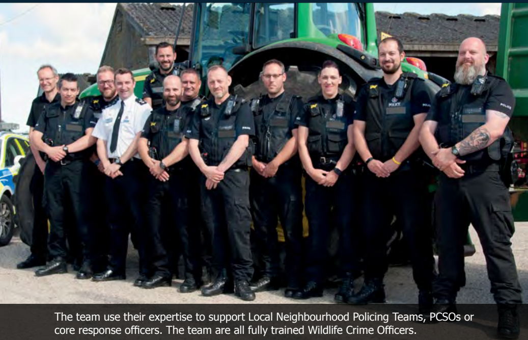
The team use their expertise to support Local Neighbourhood Policing Teams, PCSOs or core response officers. The team are all fully trained Wildlife Crime Officers.